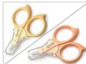
Safety Scissors P1HC03-1 Yellow P1HC03-2 Orange