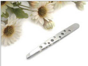
Precisin Tweezers P1CN09