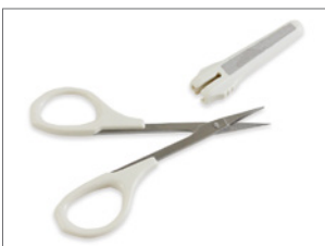
White Straight Scissors P1HB13