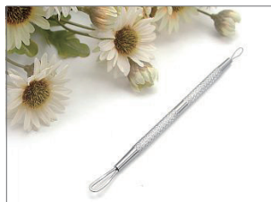
Double-end Comedone Extrator