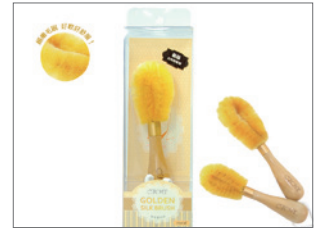
O'ICHE Golden Silk Face Brush P1QH02