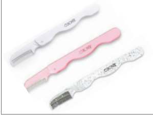
O'ICHE Metallic Mascara Comb P1CE02-White P1CE03-Pink P1CE04-Transparent