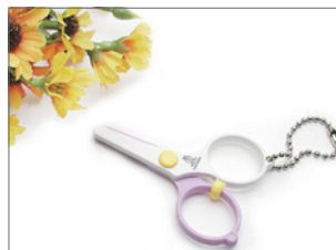
Scissor with Chain P1HC04-1 Purple P1HC04-2 Green P1HC04-3 Pink