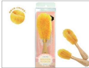
O'ICHE Golden Silk Hand/Foot Brush P1QH01