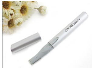
O'ICHE Electric Lady Shaver P1HH03