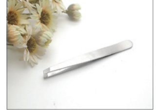
Oblique Tweezers P1CN08