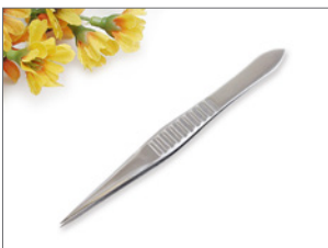
Acne Needle Remover Tool P1DR07-Straight Tweezer