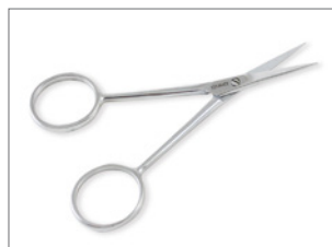
Steel Straight Scissors P1HB14