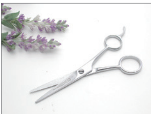
Hair Scissors P1SA01