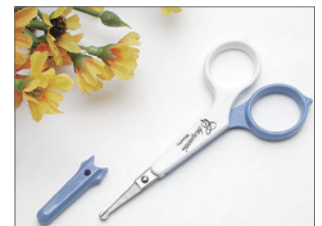
Cosmetic Scissor-Blunt P1HB08 Plastic P1HB11 Steel