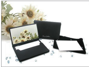
Pure Color Facial Absorbent Paper P1DP08