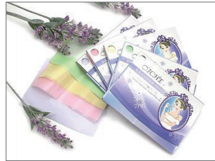
O'ICHE Facial Absorbent Paper P1DP01 -White P1DP03 -Yellow P1DP04 -Pink P1DP05 -Green