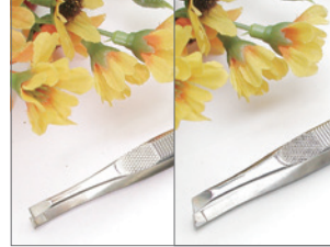
Tweezer P1CN01 -Flat P1CN02 -Angle