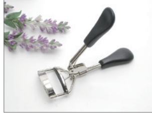
Eyelash Curler P1CF08